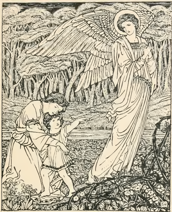
THE LITTLE BOY FOUND.